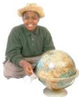
“...Most Important Natural Resource.”